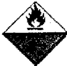
Materias Sujetas a Inflamación Espontánea.