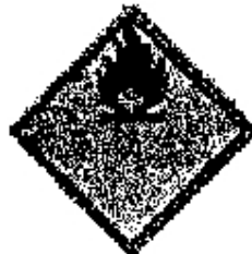
Emanación de Gas Inflamable Comburente al Contacto con el Agua